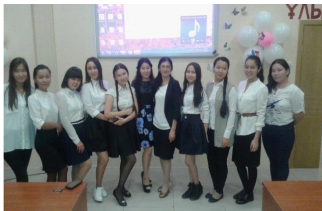
Members of the circle «English club»