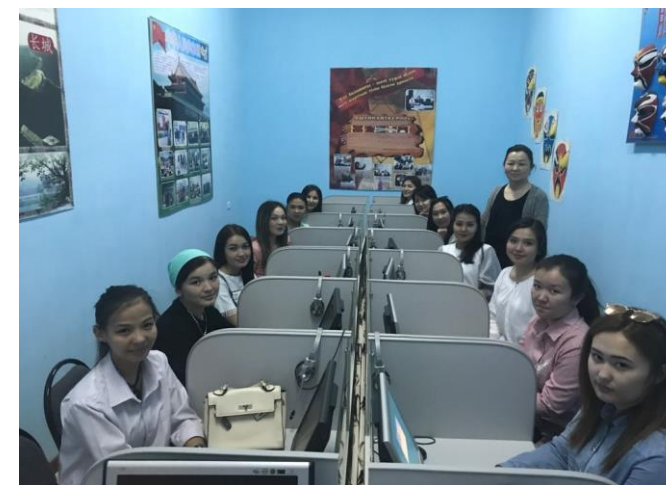
In the language laboratory