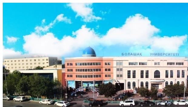
University "Bolashak" Kyzylorda