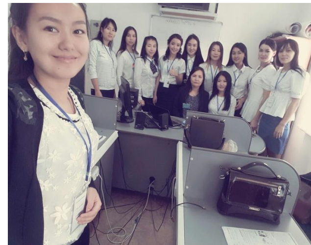
Students during the lessons